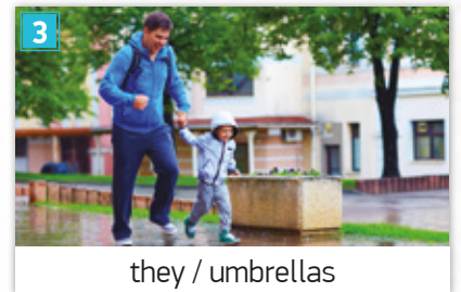
they / umbrellas