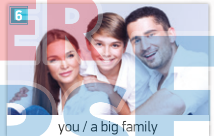
you / a big family