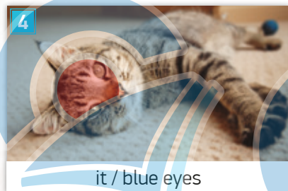
it / blue eyes