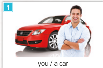
you / a car